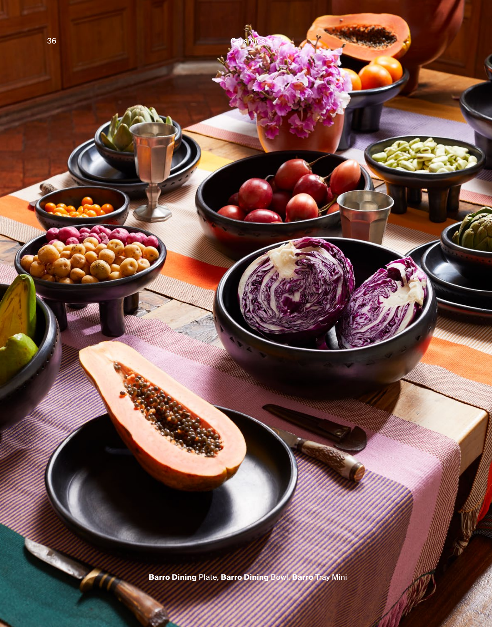
Barro Dining Plate, Barro Dining Bowl, Barro Tray Mini