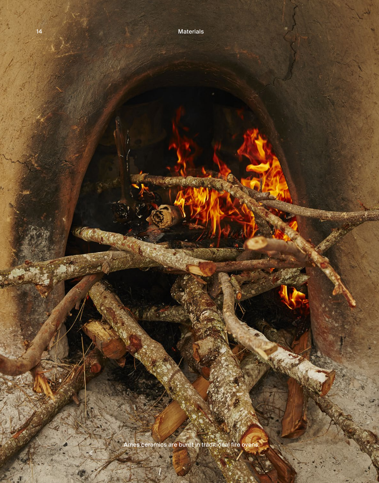
Ames ceramics are burnt in traditional fire ovens.