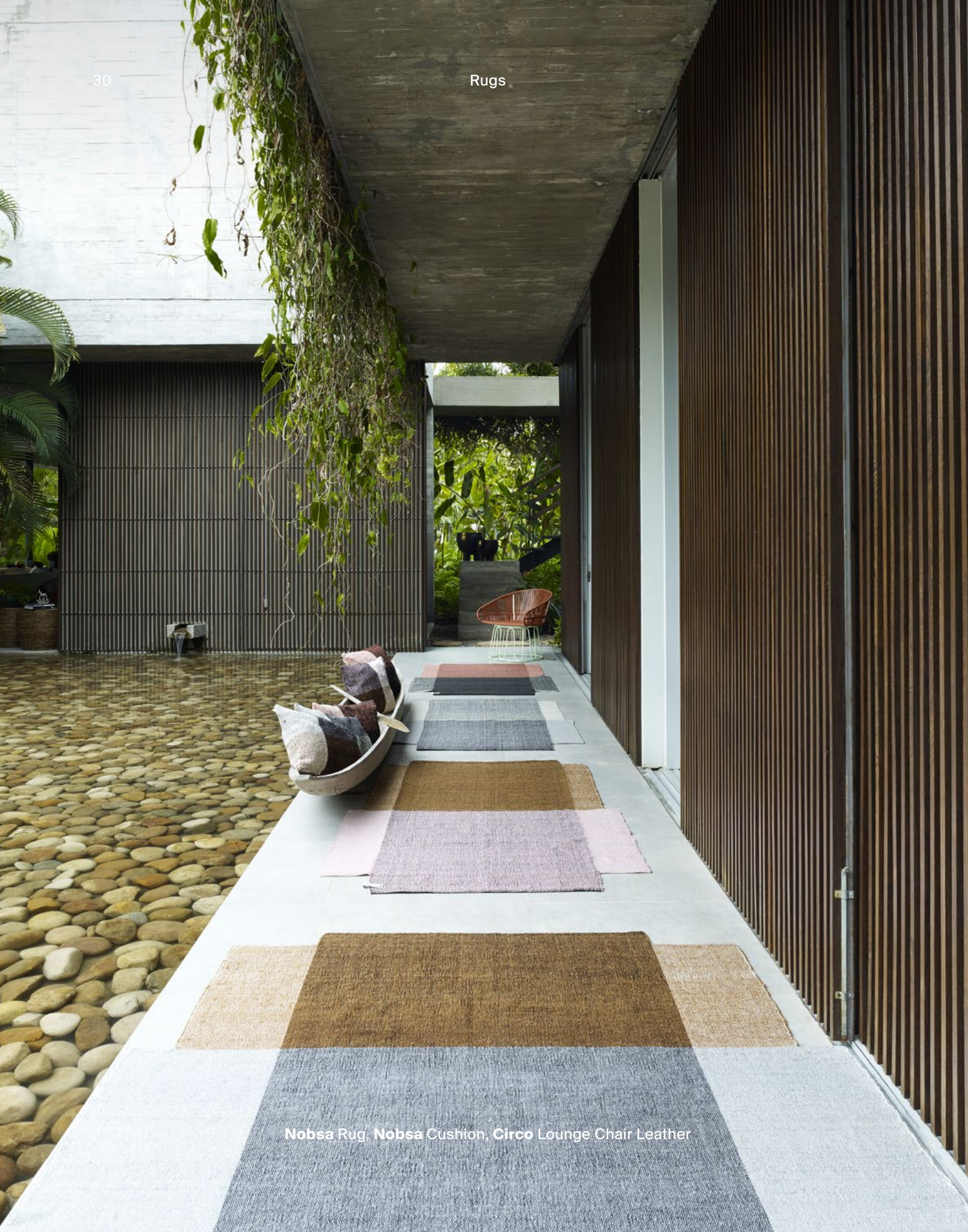
Nobsa Rug, Nobsa Cushion, Circo Lounge Chair Leather