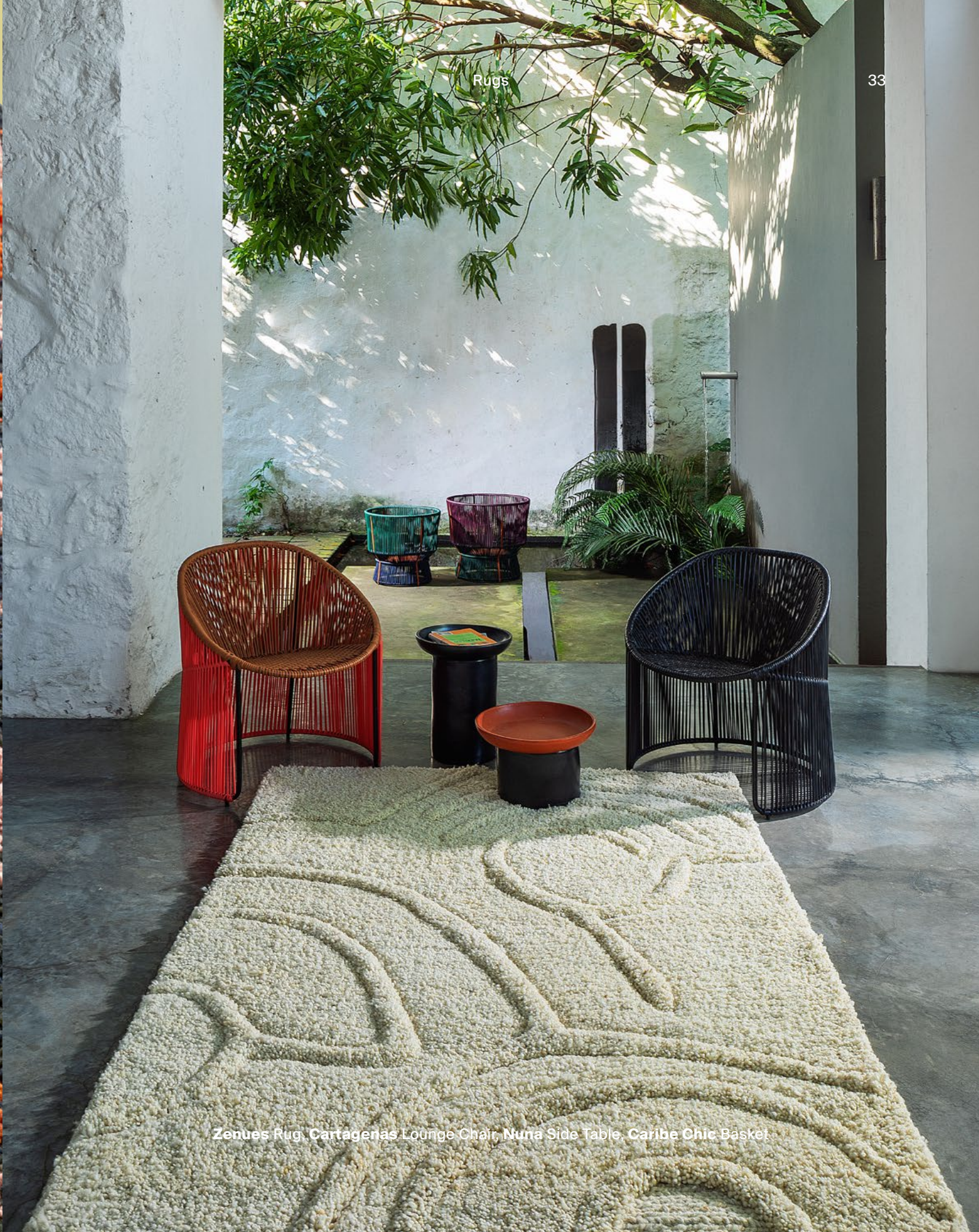
Zenues Rug, Cartagenas Lounge Chair, Nuna Side Table, Caribe Chic Basket