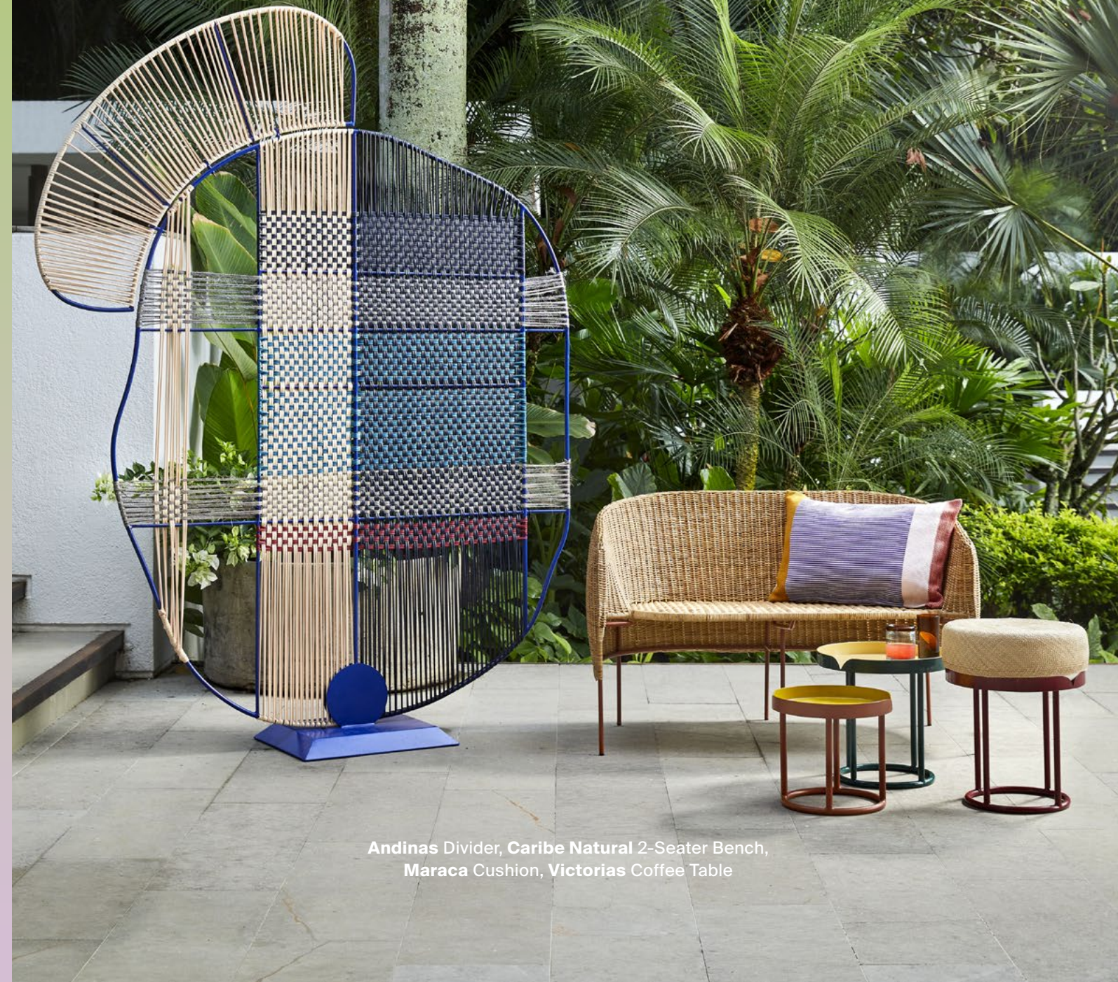
Andinas Divider, Caribe Natural 2-Seater Bench, Maraca Cushion, Victorias Coffee Table

No other country has a wider variety of palm trees than Colombia, where people have long used these leaf fibres to make everyday objects. At ames, we've found new ways to create modern design pieces with these materials that will add rich textures to any interior.