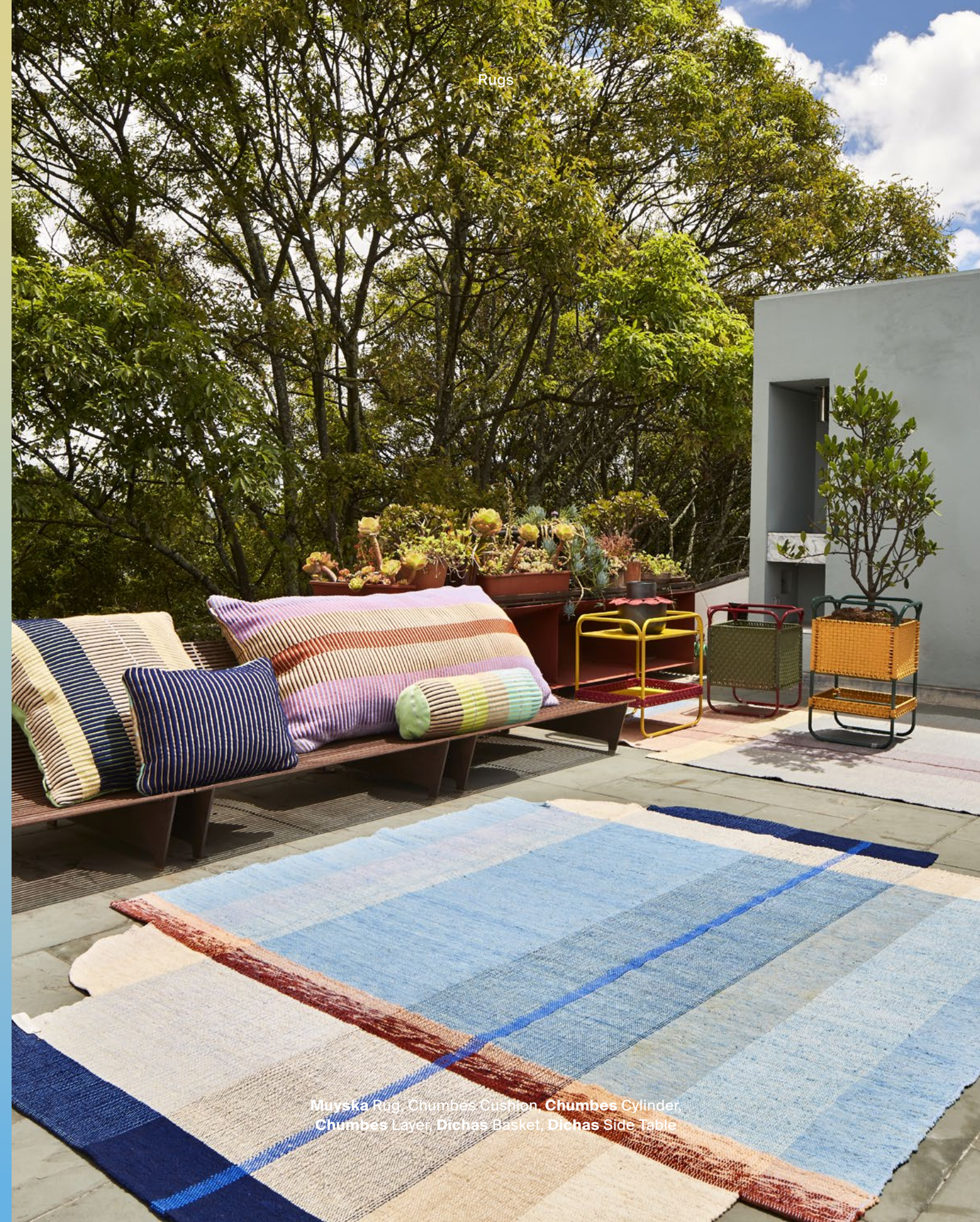
Muyska Rug, Chumbes Cushion, Chumbes Cylinder, Chumbes Layer, Dichas Basket, Dichas Side Table

From handwoven blankets and cushions to dramatic floral wall decorations and vases with charming colour blocking patterns: our range of striking accessories will liven up any space.