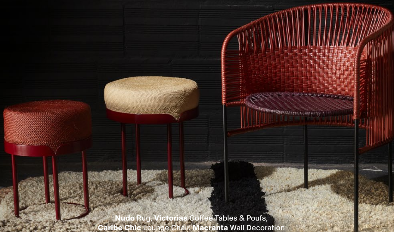
Nudo Rug, Victorias Coffee Tables & Poufs, Caribe Chic Lounge Chair, Macrahta Wall Decoration