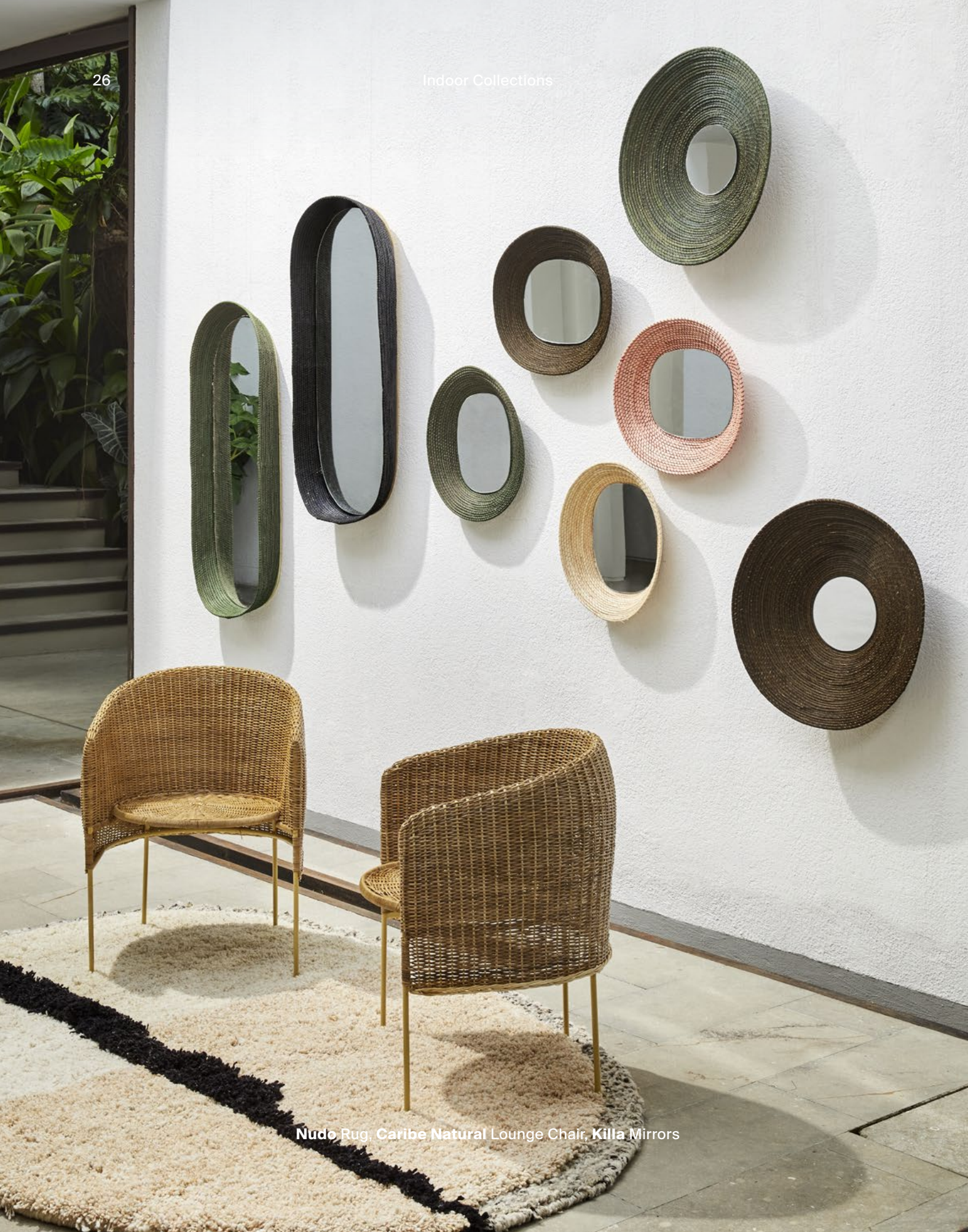
Nudo Rug, Caribe Natural Lounge Chair, Killa Mirrors