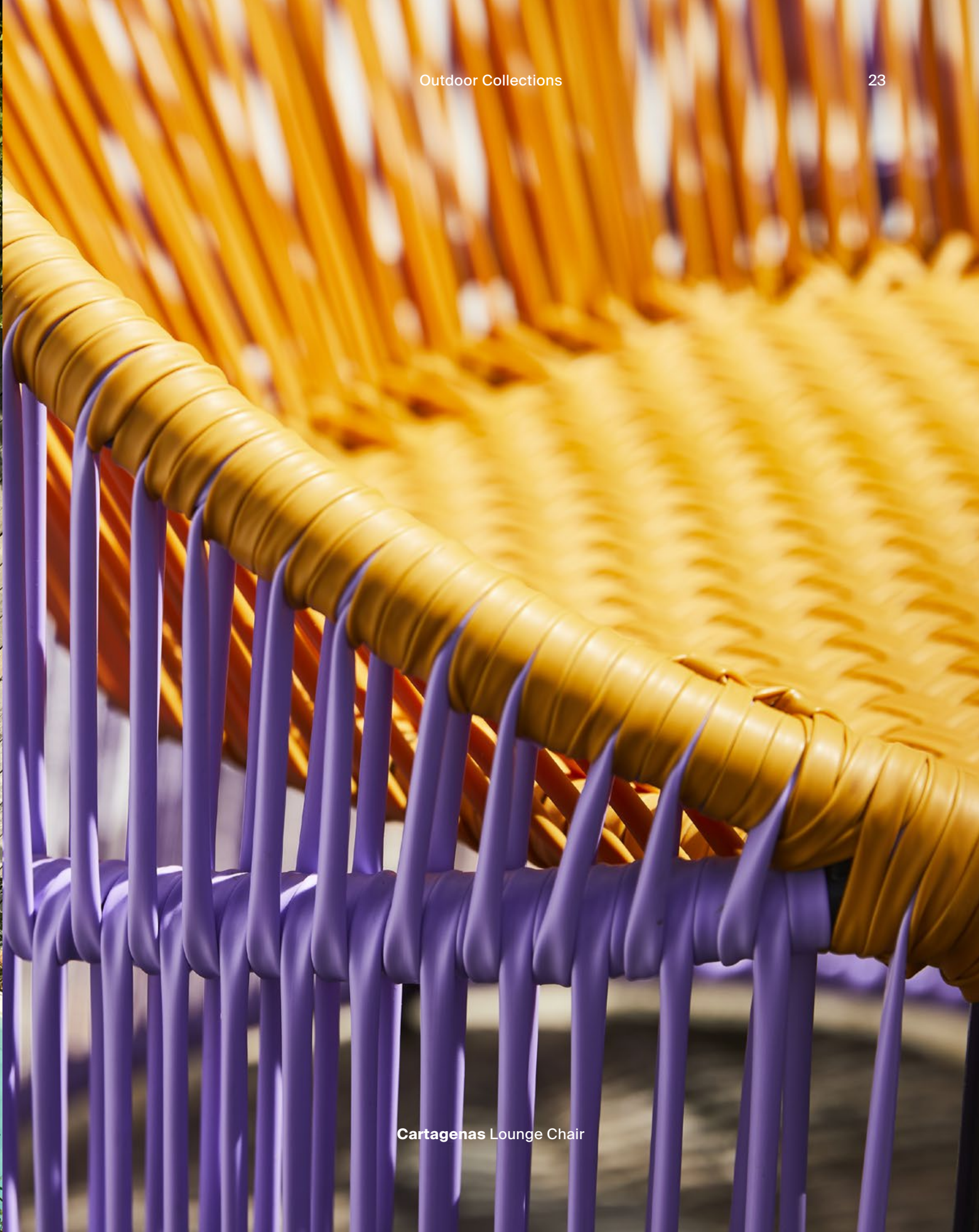
Cartagenas Lounge Chair