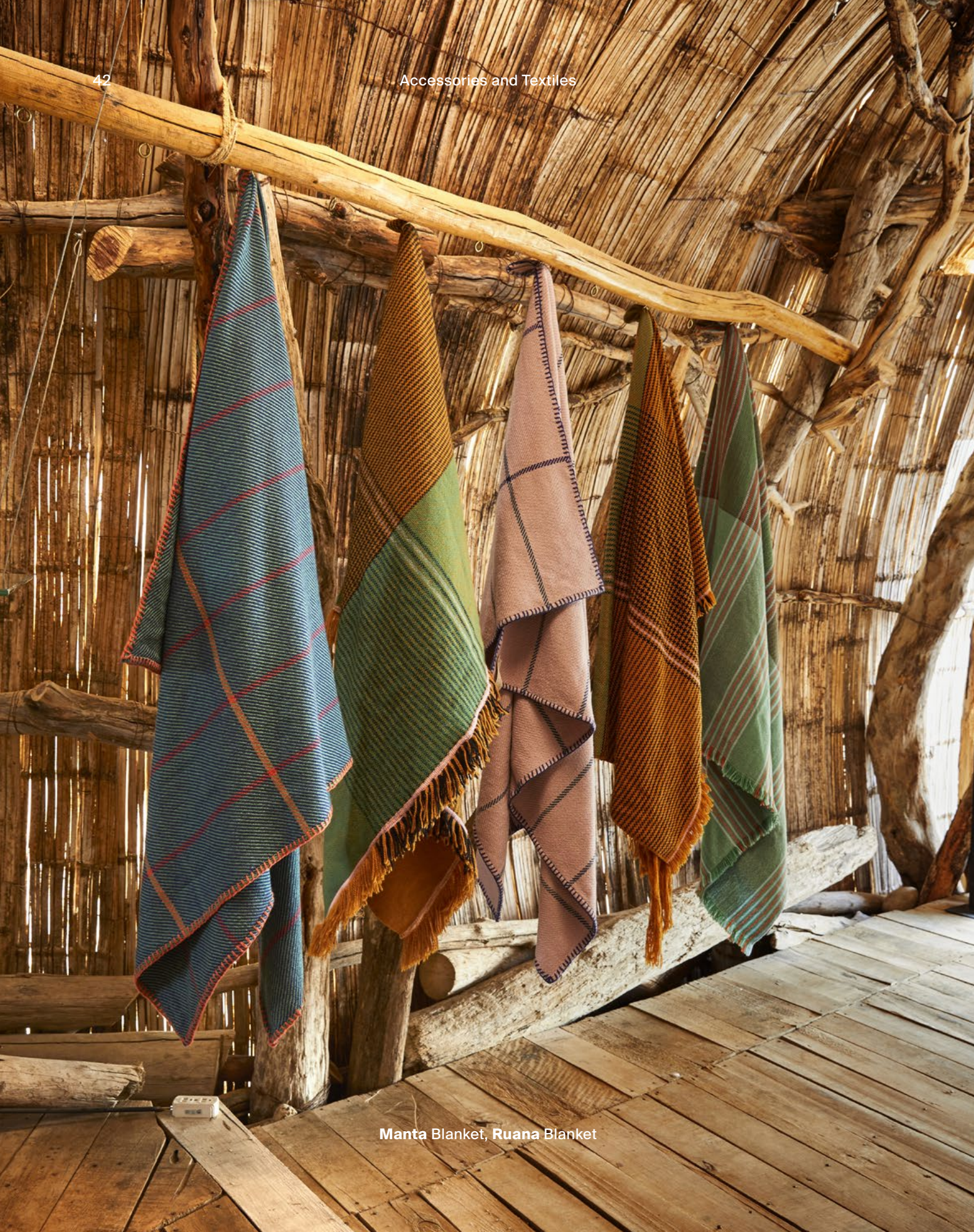
Manta Blanket, Ruana Blanket