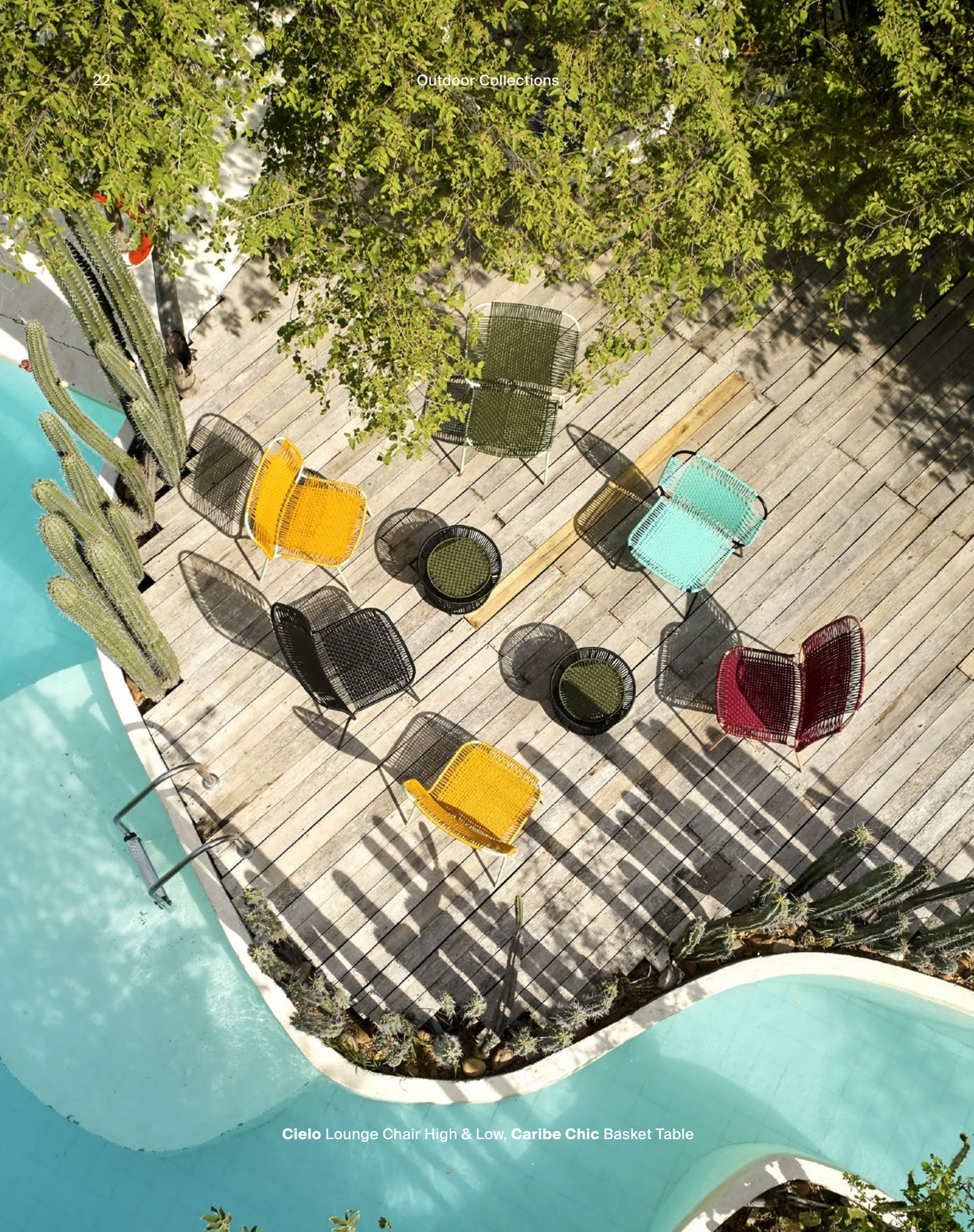
Cielo Lounge Chair High & Low, Caribe Chic Basket Table