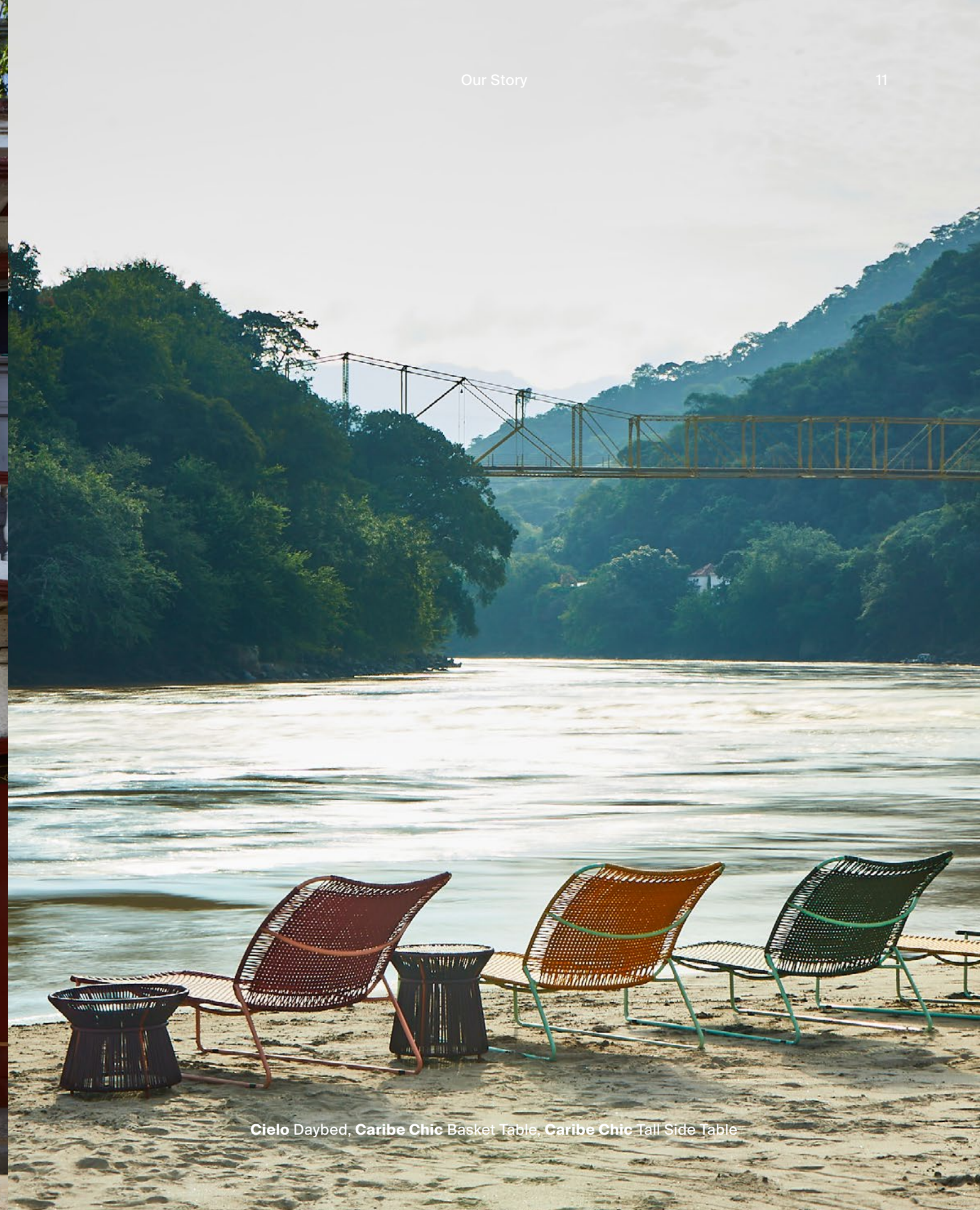
Cielo Daybed, Caribe Chic Basket Table, Caribe Chic Tall Side Table