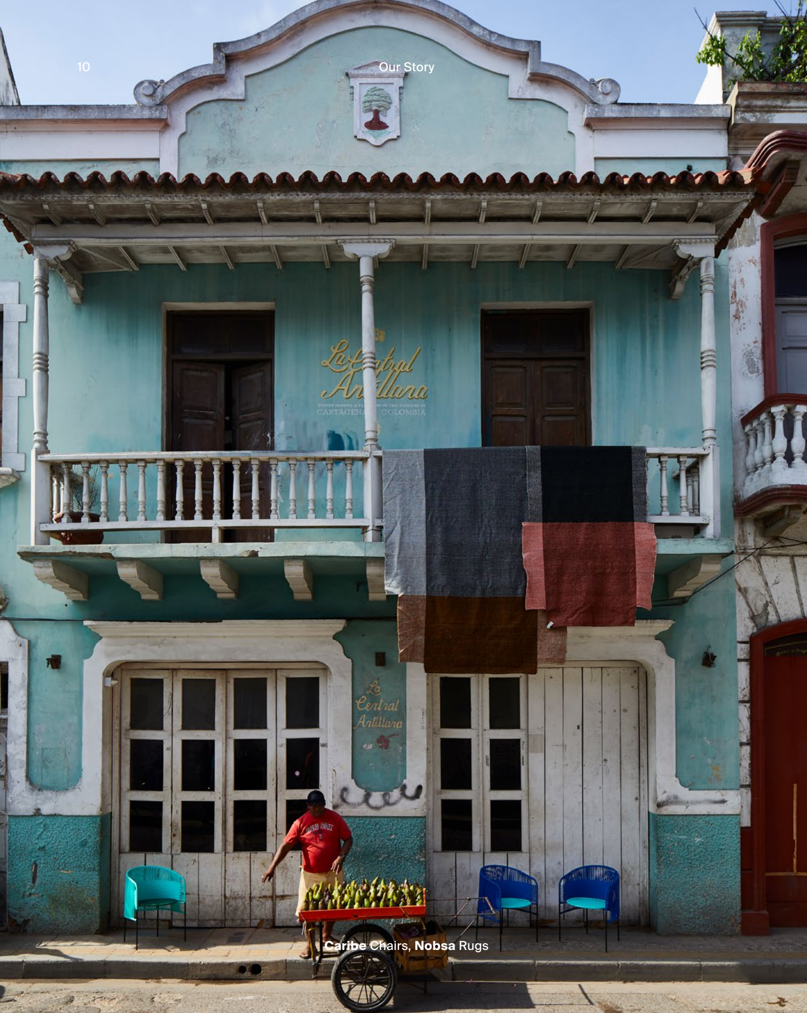
Caribe Chairs, Nobsa Rugs