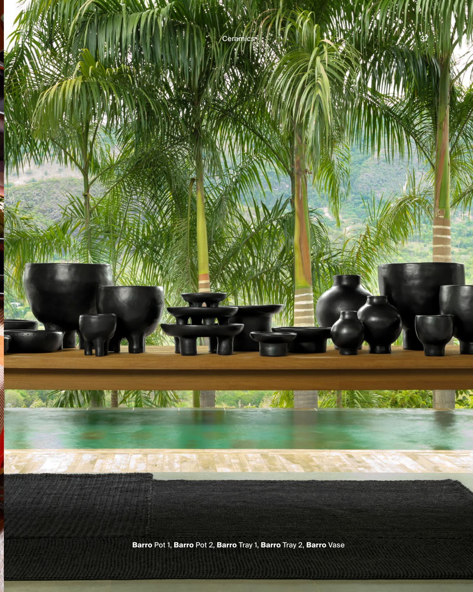
Barro Pot 1, Barro Pot 2, Barro Tray 1, Barro Tray 2, Barro Vase