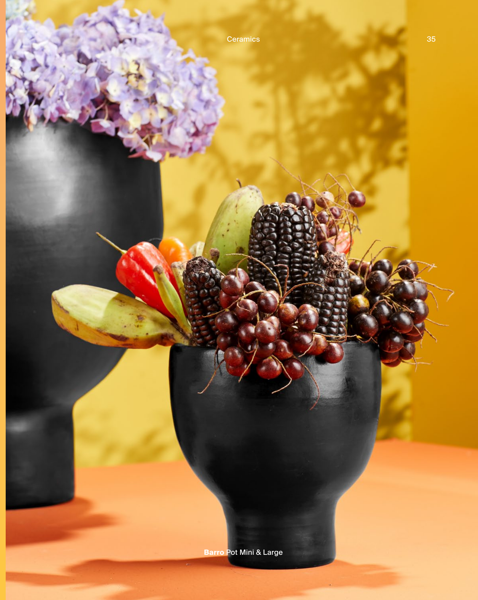
Barro Pot Mini & Large