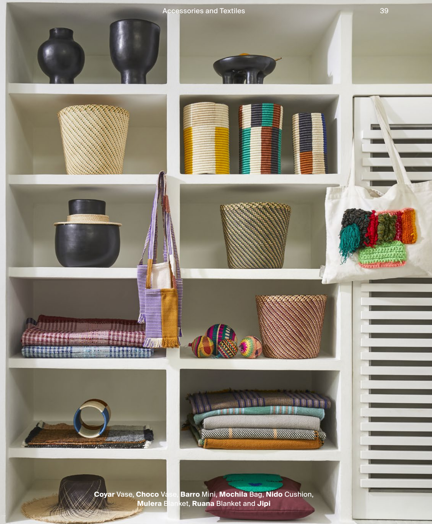
Coyar Vase, Choco Vase, Barro Mini, Mochila Bag, Nido Cushion, Mulera Blanket, Ruana Blanket and Jipi

From handwoven blankets and cushions, to dramatic floral wall decorations and vases with charming colour blocking patterns: our range of accessories offer the small touches that bring something special to any room.