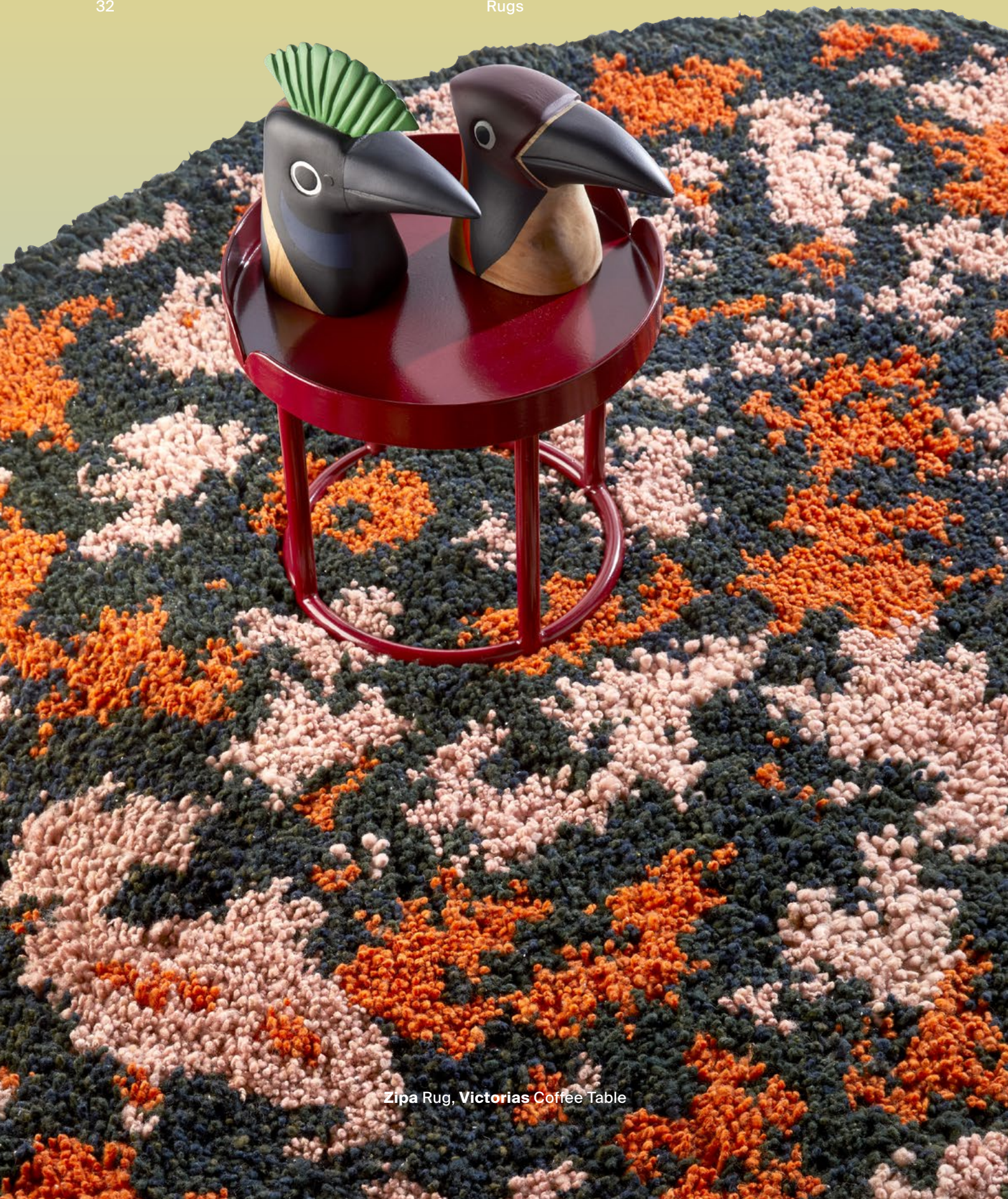
Zipa Rug, Victorias Coffee Table