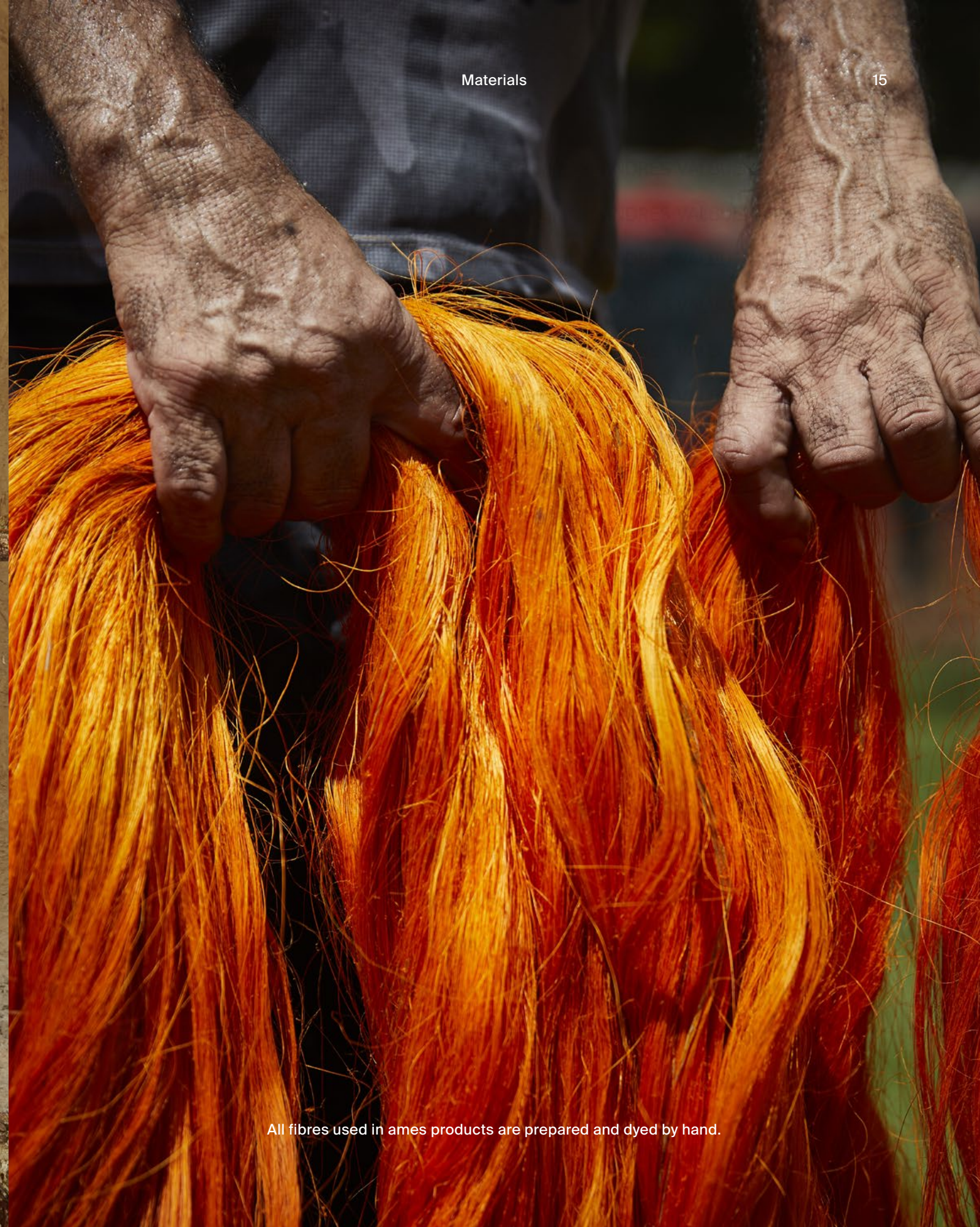
All fibres used in ames products are prepared and dyed by hand.