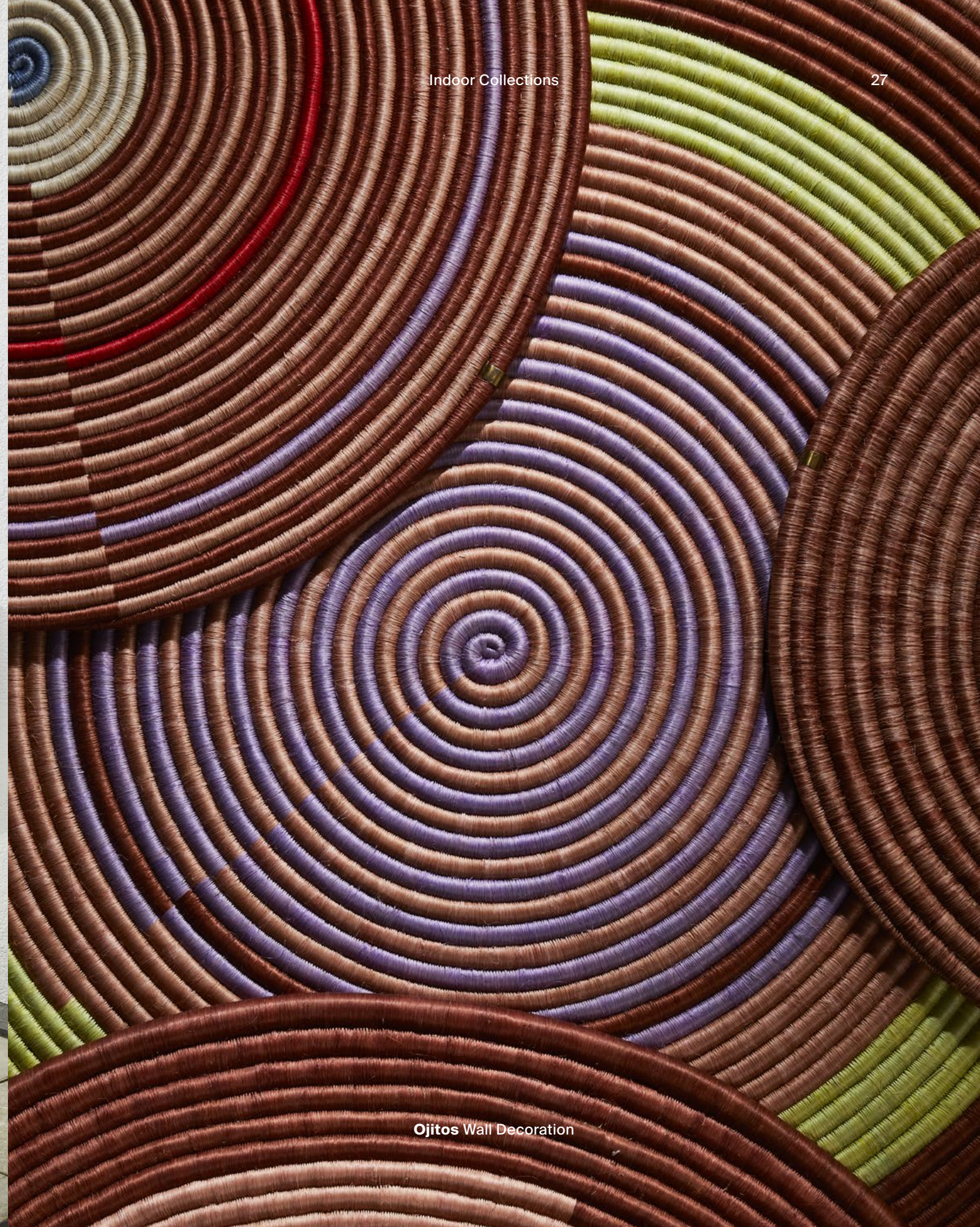
Ojitos Wall Decoration