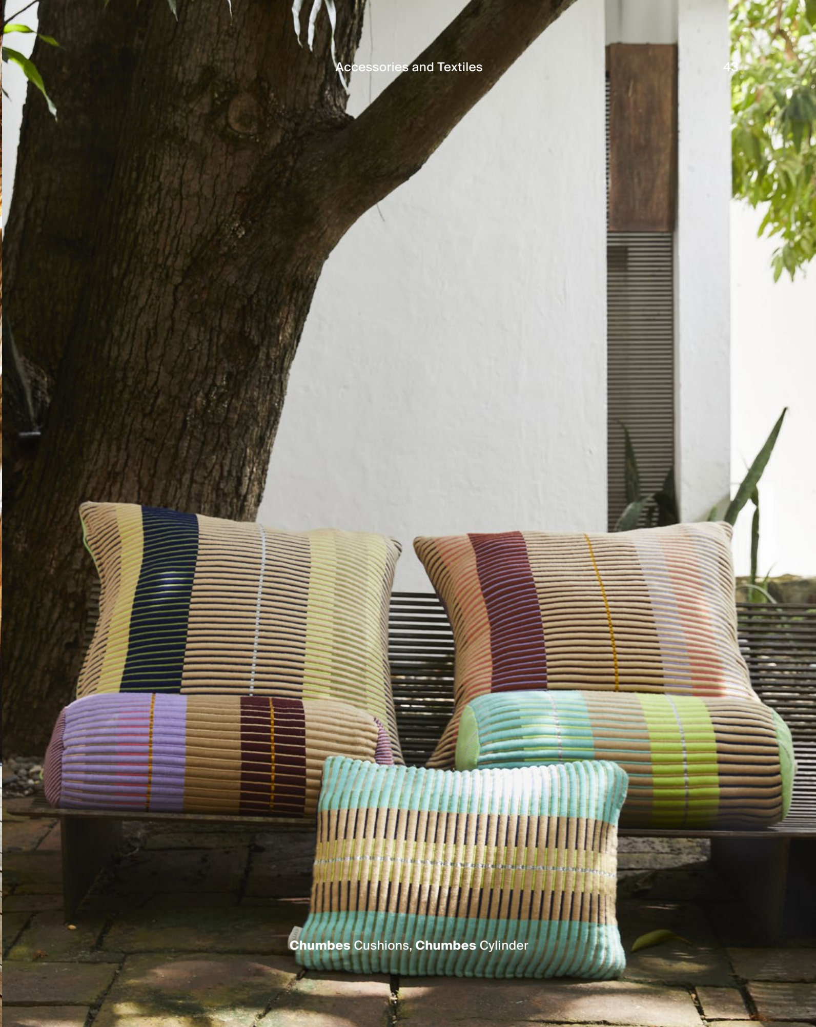
Chumbes Cushions, Chumbes Cylinder