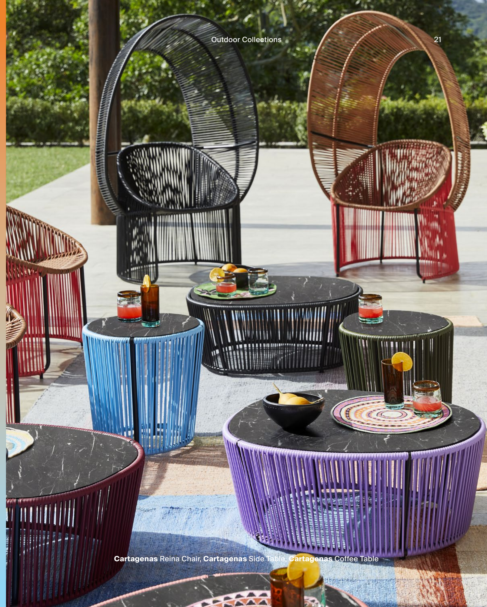
Cartagenas Reina Chair, Cartagenas Side Table, Cartagenas Coffee Table

The webbing of all ames outdoor collections is woven with hard wearing PVC strings, which are made from recycled plastic. Artfully woven in workshops in Bogota, Colombia's capital, these chairs and tables add vibrancy to any garden, terrace or pool area.