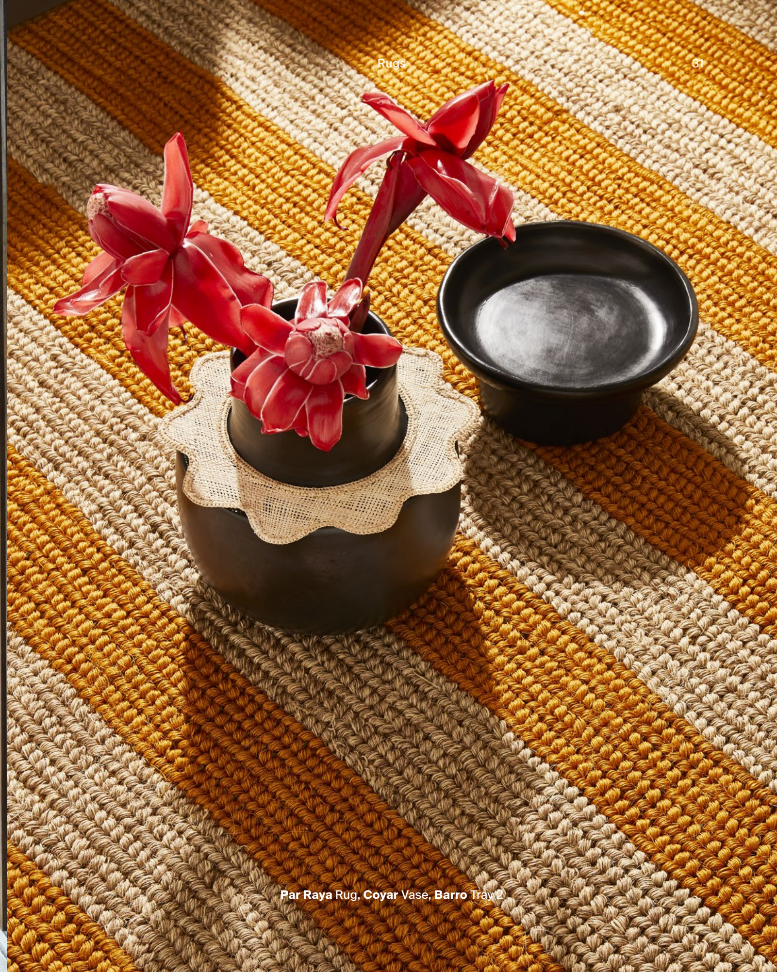
Par Raya Rug, Coyar Vase, Barro Tray 2